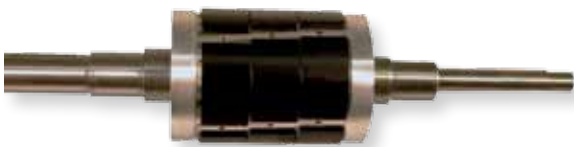
Fig. 2: PM rotor with magnets in place

motor provides the basis for the magnet wheel (rotor). The squirrel-cage rotor body is turned after die-casting, neodymium iron boron magnets are glued around the body and the whole assembly is then bandaged (see photo below).