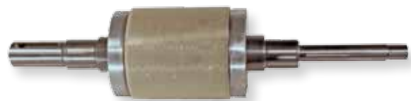
Fig. 3: PM rotor complete with bandage